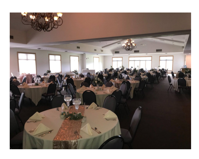
The Links at Firestone Farms Banquet Center.