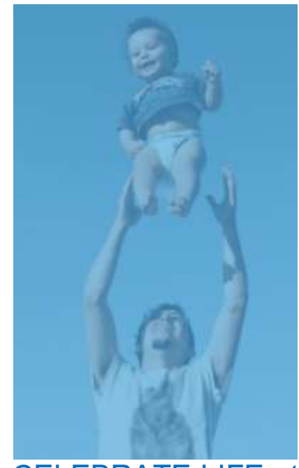
CELEBRATE LIFE at the WALK FOR LIFE

For more details on the event, and to download pledge forms, flyers, sponsor letters and more, please visit <a href="https://www.heartbeatcc.com/events">www.heartbeatcc.com/events</a>, or call (330) 386-3999.